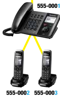
3 Users: 3 DID